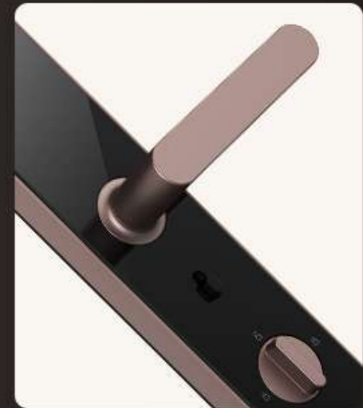
Peephole lock-picking protection

Effectively protect your home from peephole lock-pickers