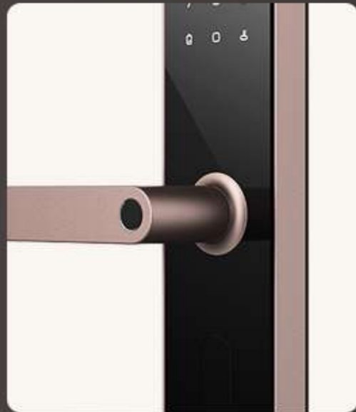
Integrated handle design

Meticulously crafted, polished details, and reliable quality.