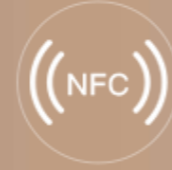
App (NFC Card)

*Temporary code need to connect with Bluetooth One-time code can be set remotely, do not need a gateway NFC card needs to be purchased separately.